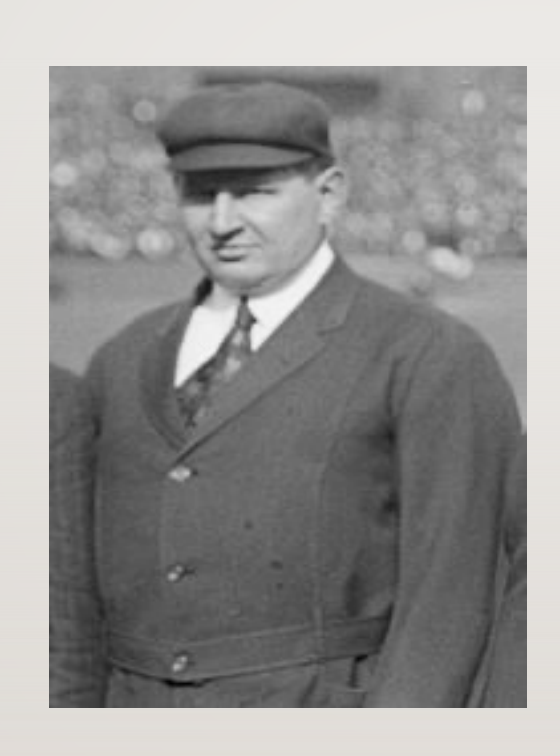
Cy Rigler 1915 World Series

Initiated arm signals for benefit of the outfield players to know what's happening